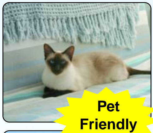
Q: What's missing from these photos?